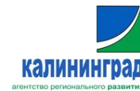
Kaliningrad Regional Economic Development Agency