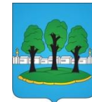
Ostrovskiy District Municipality